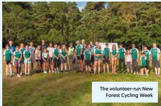
The volunteer-run New Forest Cycling Week

In Wales the government has committed to a moratorium